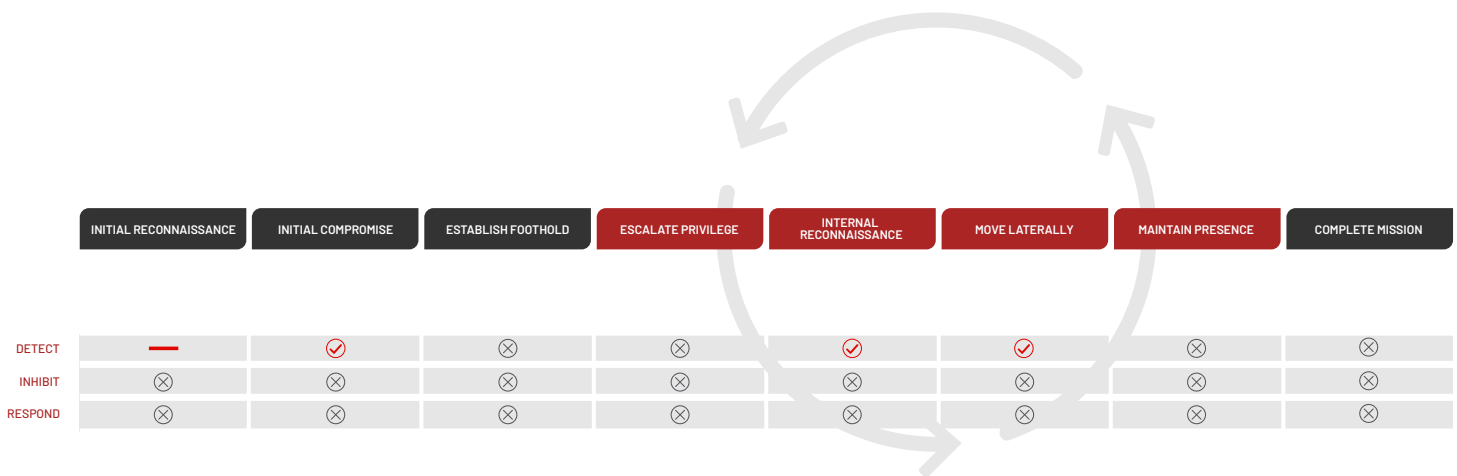
FIGURE 2. Cyber attack lifecycle.